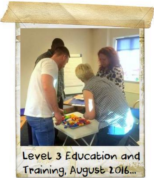
Level 3 Education and Training, August 2016...